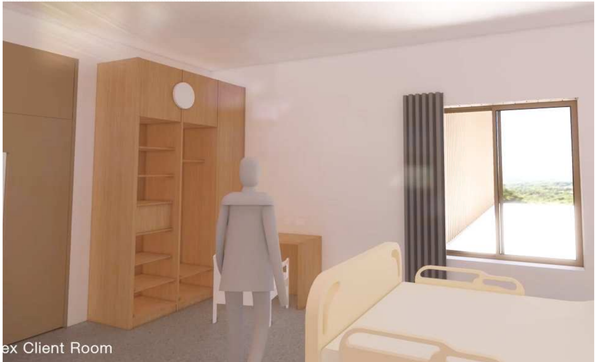
Complex Client Room