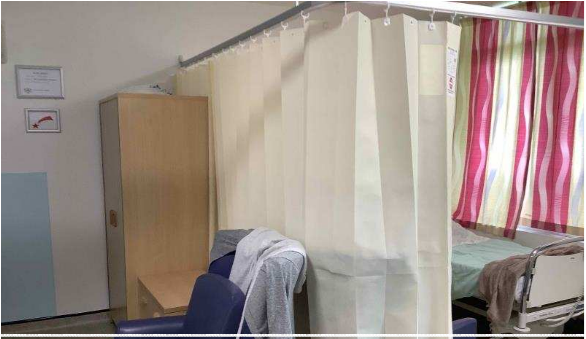
Ruby Ward – bed bay