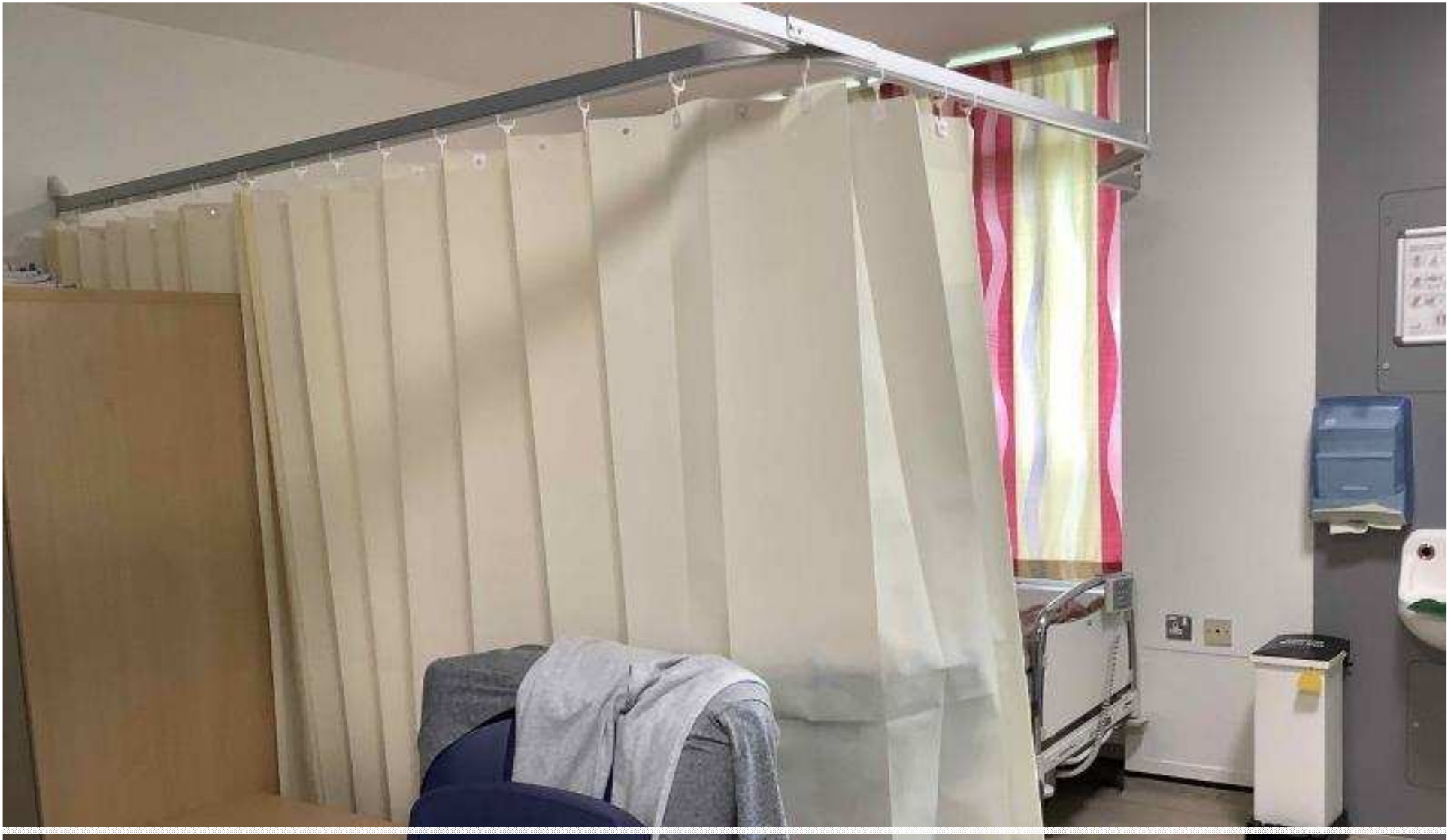
Ruby Ward – bed bay